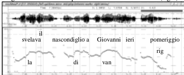
Fig. 1. Broad focus sentence from set B (see table 1 for translation).

Broad focus sentences in the corpus were realized with either H* or H+L* pitch accents on the verb and its complements 10 (in the matrix sentence). The following adverbial phrase was usually realized with a compressed pitch range and with a H+L* pitch accent on the final word (fig.1).