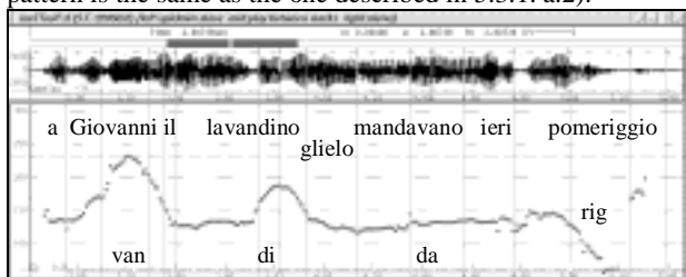
Fig. 4. Sentence from set TTM: the two topics are realized as different prosodic units.

When the topic constituents are in marked order speakers never appear to collapse the two topics. The usual pattern is characterized by H* pitch accents separated by a very low target point. The last pitch accent is always downstepped (the pattern is the same as the one described in 5.3.1: a.2).