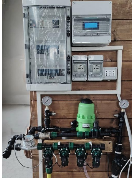
Fig. 3. Front view of the central unit in standalone configuration with integrated pump. Top: logic panel with microcontroller, power supply, and relay system. Bottom: hydraulic manifold with zone solenoid valves, pressure gauges, and impulse water meter.

The SolarFertigation central unit is engineered to adapt to different operational configurations based on field size, water availability, and energy supply strategy. Structurally, each central unit can be customized with: