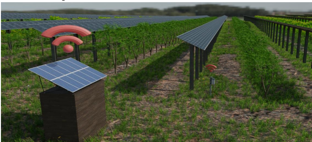
Fig. 4 Rendering of the integrated APV with SolarFertigation system.

The SolarFertigation system is designed for synergistic use with agrivoltaic systems, which combine agricultural production with photovoltaic energy generation on the same cultivated land. The aim is to support the ecological transition through a multifunctional and optimized use of available agricultural surfaces.