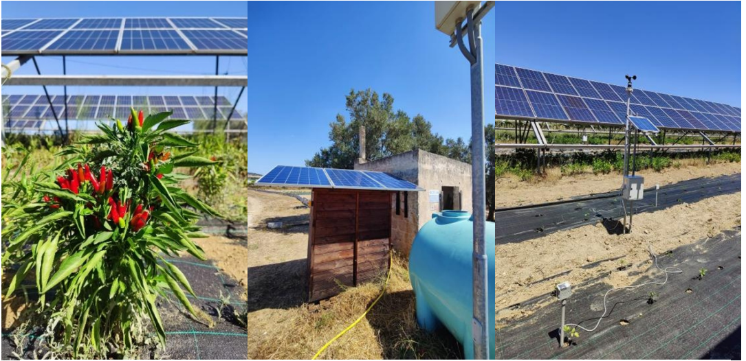
Fig. 5 Experimental campaign in an agrivoltaic field (Province of Taranto, Italy).

Figure 4 presents a 3D rendering of the integration between the agrivoltaic installation and the SolarFertigation system. This integration was validated through an experimental field campaign conducted at a commercial photovoltaic plant adapted to an agrivoltaic configuration in the Province of Taranto (Italy) (Fig.5), where the complete system architecture was implemented, including a central fertigation unit and a network of four sensor nodes.