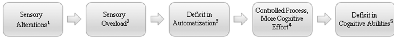
Fig. 3. Sequential breakdown illustrates how sensory alterations can have cascading effects on cognitive processes. 1 Atypical sensory processing in individuals with ADHD. 2 Resulting from sensory alterations, individuals may experience an overwhelming amount or insufficient sensory information from various sources. 3 Sensory overload disrupts the ability to automate behaviors and process information efficiently without conscious effort. 4 Due to deficits in automatization, controlled cognitive functions in cortical areas must work harder to compensate. 5 The increased cognitive effort and compensation can lead to deficits in various cognitive abilities, including attention, memory, and impulse control.