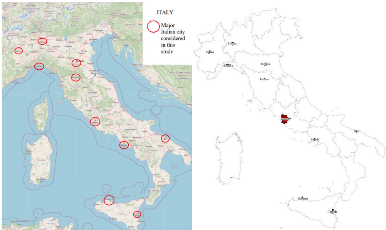
Fig. 1. Location of major Italian cities in terms of population (>300,000 inhabitants) on the left and their area width on the right (highlighted in red). (For interpretation of the references to colour in this figure legend, the reader is referred to the web version of this article.)